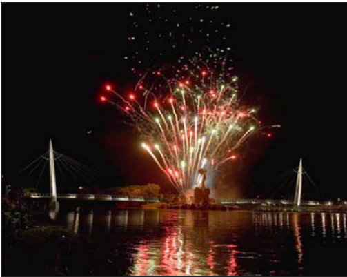
Keeper Dedication May 18, 2007