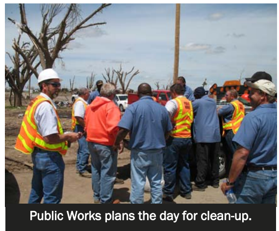
Public Works plans the day for clean-up.

to serve as Greensburg's public safety operations and returned home on June 4.