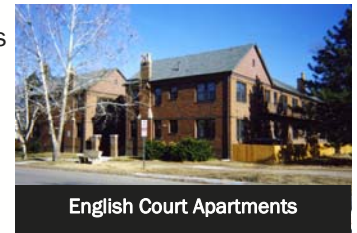
English Court Apartments