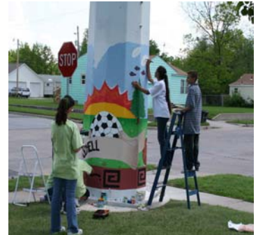
Pleasant Valley Art Students

Keep on the lookout for more poles to be painted adding outdoor art to area neighborhoods.