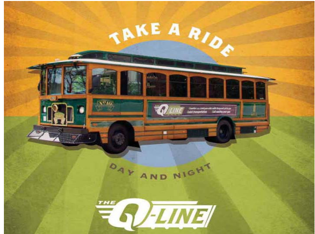
This booklet was inserted in the Wichita Eagle on May 31. Get your copy in the 1st Floor Info area. For multiple copies, call the CMO!

Theme Tour: The Frank Lloyd Wright Tour/Allen Lambe Interior Tour will include a guided tour of the inside of the Allen Lambe House. Prices are $20 per person and no discounts apply. Tours are every other Saturday at 12:30 p.m.