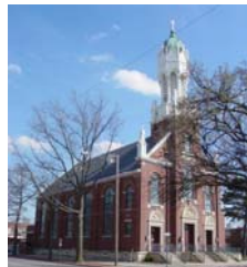
St. Anthony of Padua Catholic Church

Historic Preservation Two projects in Wichita were selected to receive recognition for their efforts to preserve Kansas heritage by the Kansas Preservation Alliance. These two projects competed for recognition against other projects submitted from throughout the state.