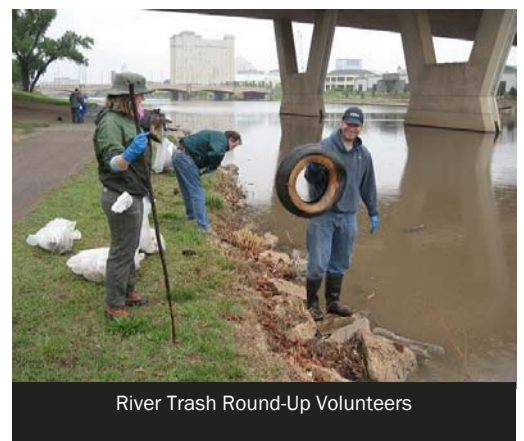
River Trash Round-Up Volunteers

will focus on the Little Arkansas River on June 23rd.