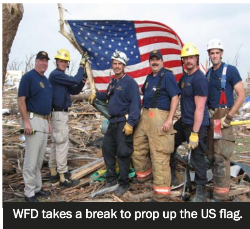
WFD takes a break to prop up the US flag.

On the evening of May 4, a deadly tornado swept through Greensburg leaving the town destroyed. Soon after, the City of Wichita Fire Department deployed 30 people to assist in search and rescue efforts, particularly at the destroyed Greensburg hospital. The Wichita Police Department assisted with security and public safety. WPD found looters and arrested them. WPD and WFD remained