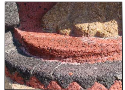
Detail of Minisa Bridge

Moreover, in addition to adding pigments, the company introduced another innovation by using crushed colored glass as an aggregate in some of its