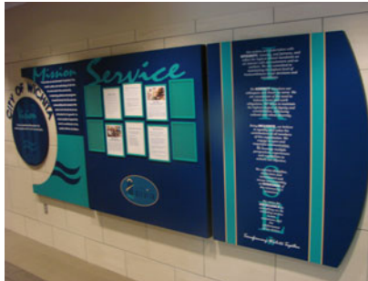
The Recognition of Service display was recently installed on the 1st floor of City Hall.

"This is something totally different in that it allows employees to recognize each other" said Chris Atlee, Team Leader of the recognition program. "Typically, recognition comes from supervisors and they might not be around to see the positive actions of their employees. This type of program allows you to recognize a fellow employee