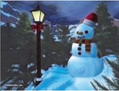
City Hall will be closed December 25 and January 1