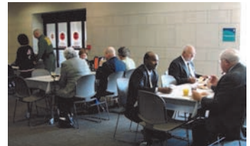
Citizen Academy graduates enjoy a reception after being recognized at the Nov. 6 Council Meeting.

Citizens are encouraged to attend the academy by their neighborhood organizations and through information they can receive on the city website. Once they graduate, they are encouraged to become more involved in their city, their community and their neighborhood.