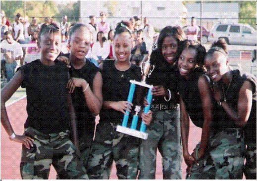
Variety show participants from Community Unity Day