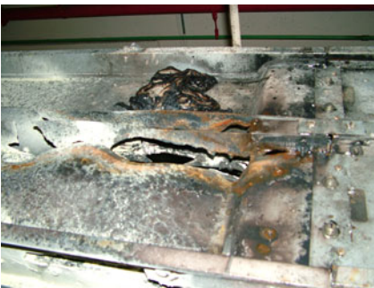
Close up of electrical buss that exploded.