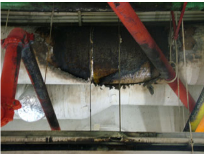
Entire area of electrical fire.

The fire protection sprinklers extinguished the flames, and quick action by the Fire Department to set fans and ventilate the building prevented serious smoke damage. As soon as Fire officials allowed Building Services staff