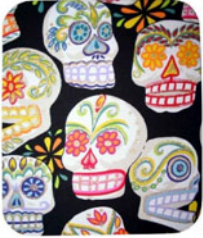
Exhibit: Day of the Dead; Exhibit Dates: Oct. 30 - Nov. 3; Reception: Nov. 2, 6-8pm Once again we celebrate the Day of the Dead at CityArts.

Exhibit: 5th Annual Arts Council Juried Exhibition; Exhibit Dates: Oct. 5 – 27; Reception: Friday, Oct. 5, 6-8pm; Juror: David Newell, Curator of the Gilcrease Museum.