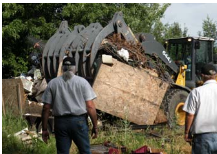
Public Works employees dispose of trash in Planeview area.

An unsightly mess that had been illegally left on City property in Planeview was eradicated this month, thanks to Public Works and the Wichita Police Department (WPD). Two dump trucks and a large trailer, all full of trash, were abandoned on City property, creating a difficult clean-up problem.