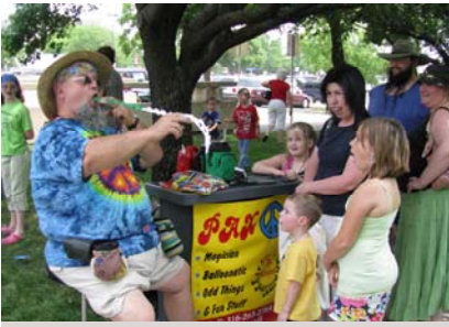
Nearly 350 attendees came to the Central Library's Summer Reading Kick-off Party.

June was a busy month for volunteers and staff at the Wichita Public Library. Seven branch libraries set all-time monthly circulation records during the month of June. Circulation of library materials for the month of June surpassed the same period of 2008 by 24%. Library card registrations are also growing, up 15% from the same time period last year.