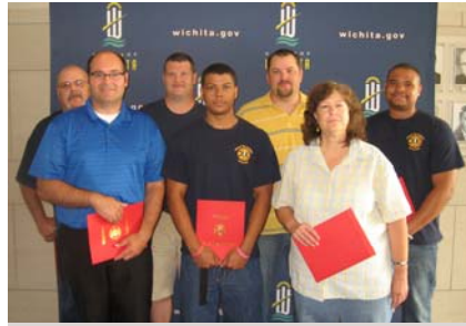
Members of the first Citizen’s Fire Academy.