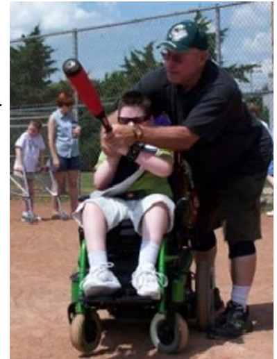
A baseball player receives assistance from his Buddy.