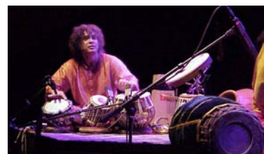
Zakir Hussain, Indian classical drummer will perform at Mary Jane Teall Theater.