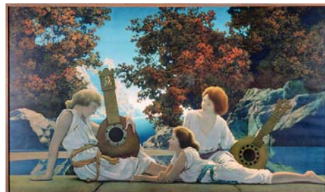
The Lute Players, 1922. CR 7G, #680, lithograph: 26" X 38" (est.). Fantasies & Fairy-Tales: Maxfield Parrish and the Art of the Print is organized by the Trust for Museum Exhibitions, Washington, D.C.

Poe's words come to life through the works of art from the Museum's permanent collection. Each chilling work of art is accompanied by a quote from one of Edgar Allen Poe's many memorable stories. Beware! This exhibition will take you for a walk through the darker side of WAM's art, and Poe's prose.