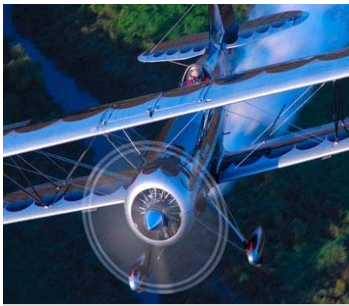
Wichita Aviation Festival , Aug. 29-30 at Jabara Airport. For more information go to www.WichitaFlightFestival.com