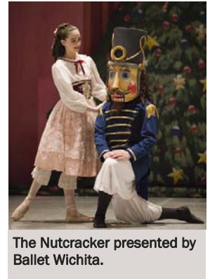
The Nutcracker presented by Ballet Wichita.