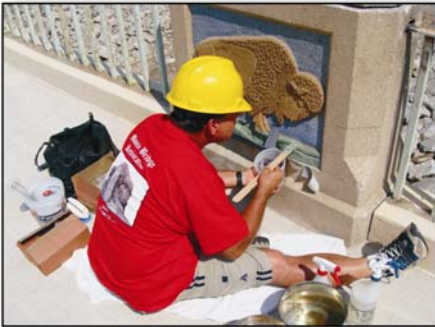
Restoring the Past