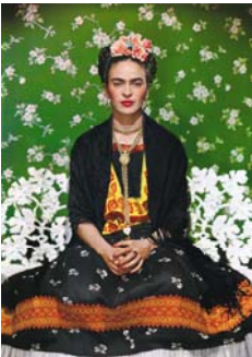
Nickolas Muray, 1892-1965, American (b. Hungary), Frida on White Bench, New York, 1939, Carbon process print.

Frida Kahlo: Through the Lens of Nickolas Muray Dec. 7 – Feb. 1