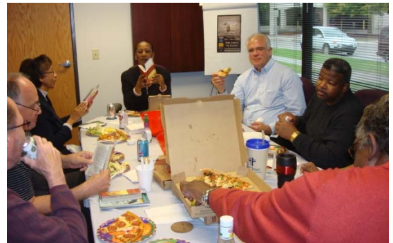
Housing staff members eat lunch and discuss "My Antonia."