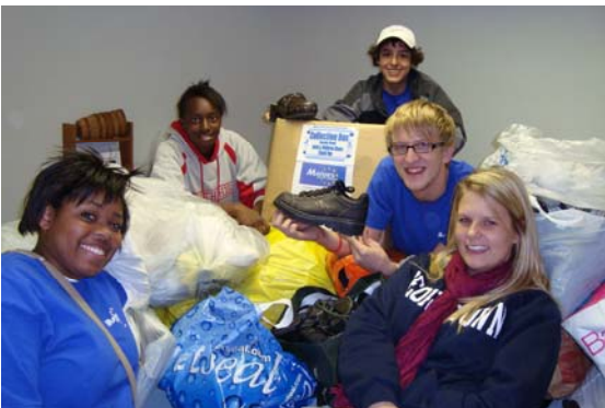
Members of the Mayor's Youth Council and some of the shoes that were collected.