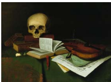
William Michael Harnett, Mortality and Immortality (1876). Oil on canvas, 22 1/4" x 27 1/4", The Roland P. Murdock Collection, M58.45, used courtesy of the Wichita Art Museum.