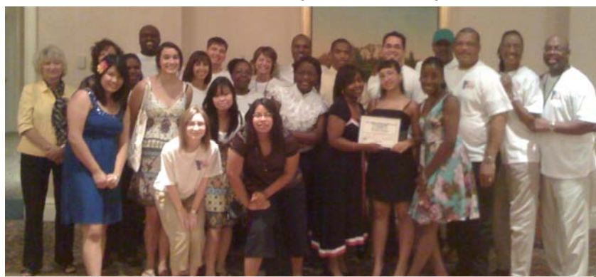
Members of the All America Team in Tampa for the competition

Wichita will celebrate its All-America City (AAC) victory with a block party from 6 to 9 p.m. on July 31 in Old Town Square. The party will mark the first use of a state law that allows outdoor drinking on public property at permitted events. The party will feature two local bands, food and beverages for purchase and local dignitaries. Wichita was named an AAC winner in June, claiming the national recognition for the fourth time and first time in a decade.