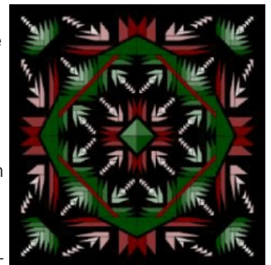
2010 Common Threads Quilt

Common Threads 2010 Quilt Show , presented by Prairie Quilt Guild, 10 a.m. – 9 p.m. on June 25, 10 a.m. – 5 p.m. on June 26, and 12 p.m. – 4 p.m. on June 27.