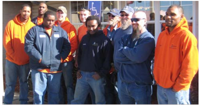
Water Distribution services crew

The main line crews share their successful safety record with the services crews work group, also from Water Utilities Distribution. Services crews completed 18 months of consecutive work without a lost day incident in January of this year and received a luncheon to acknowledge their tremendous accomplishment. That milestone marked the second time the services crews were recognized for their safety record in the last four years, with a previous safety record of 693 days that ended in July 2008. The City's policy now requires a work group to reach 18 months before receiving this recognition.