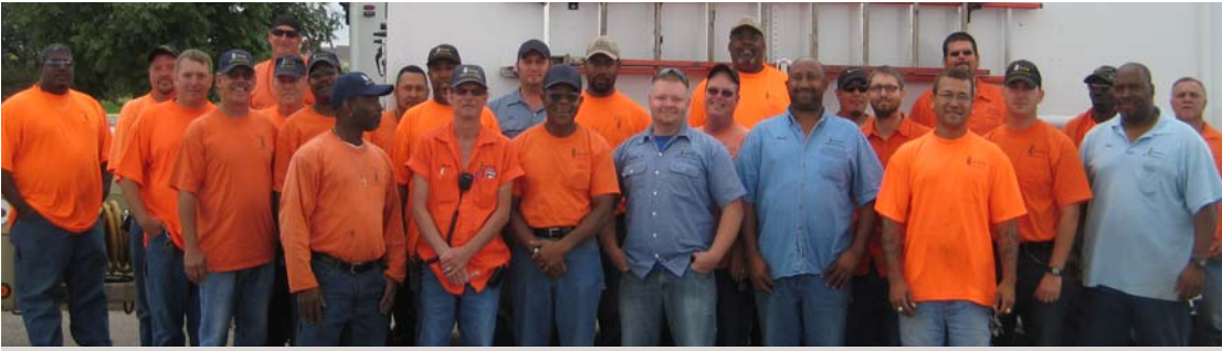
Members of the Water Distribution main line work group

The main line crews from Water Utilities' Distribution division recently closed out an amazing record safety streak, working 833 consecutive days without a lost day incident. Beginning Jan. 11, 2008, the crews worked through April 22, 2010, before an unfortunate on-the-job injury ended their