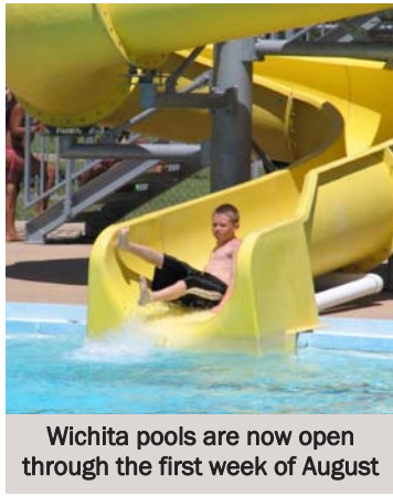
Wichita pools are now open through the first week of August