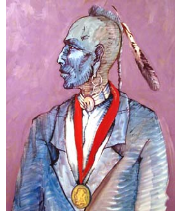
One of American Indian-themed paintings currently on display at Mid-America All-Indian Center.

Sampling of American Indian-themed paintings from the museum's Foley Family and the Palmer Family collections. Both the Foley and Palmer families are from the Wichita area.