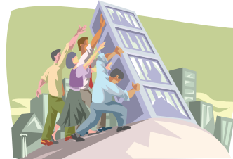
McCormick Neighborhood Association is in the process of revitalizing their membership.

This method has worked for the McCormick Neighborhood Association and could also help your neighborhood association.