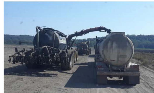
Loading material for land application