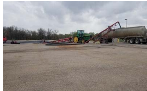
Mixing odor suppressants