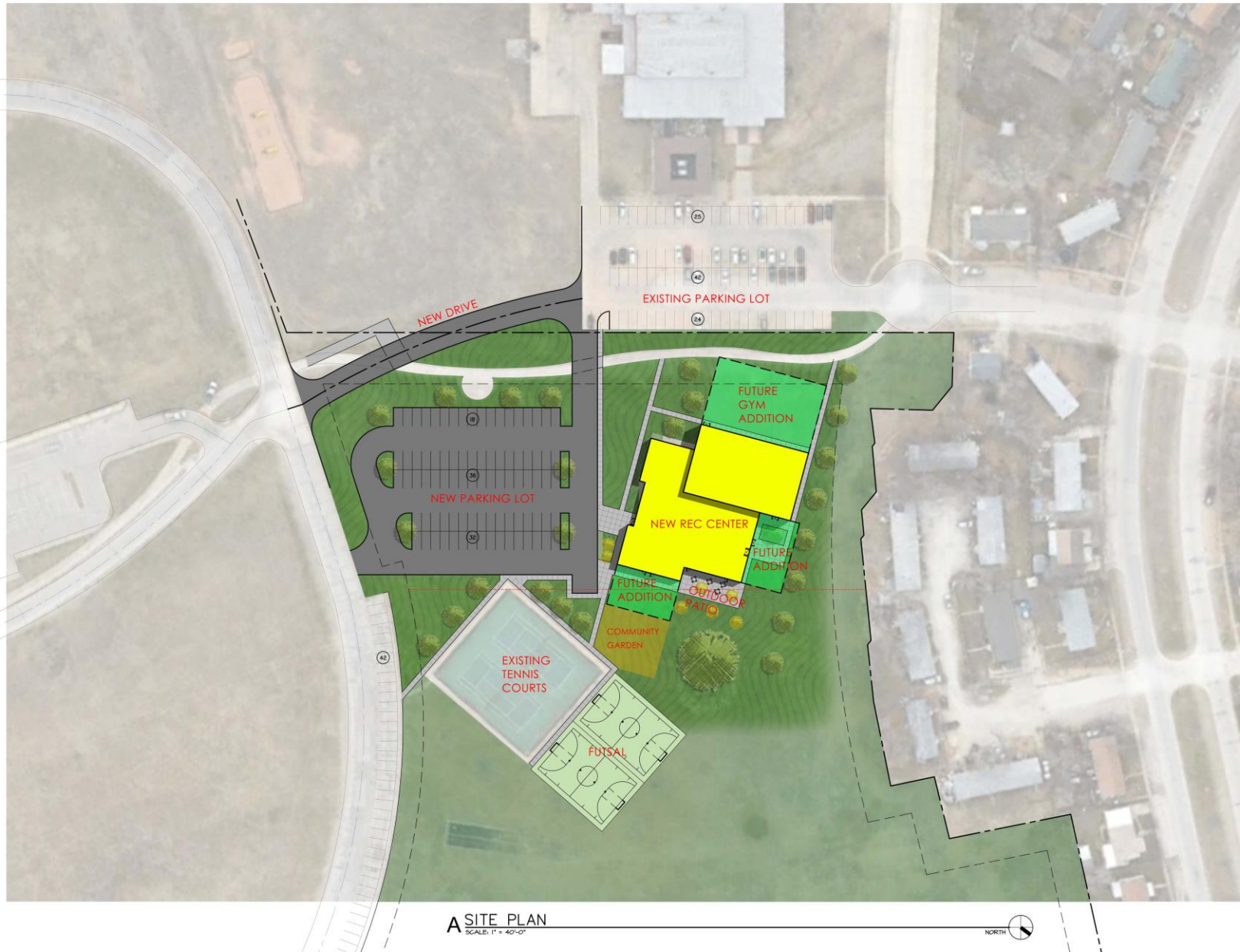
A SITE PLAN SCALE: 1" = 40'-0"