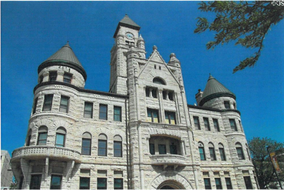
Wichita/Sedgwick County Historical Museum