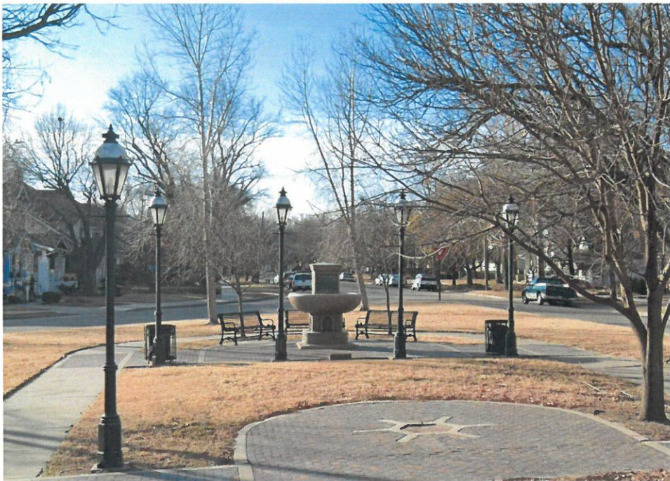
Dog and Horse water fountain at 17 th and Park Place