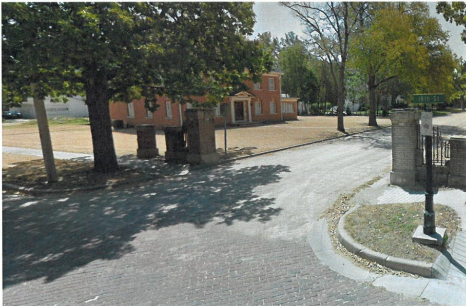
Entry pillars to the Park Place/Fairview Historic District